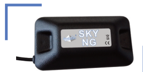
Sensor for basket