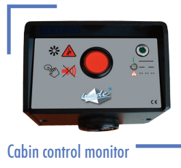
Cabin control monitor