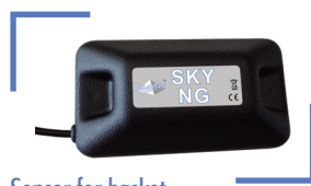
Sensor for basket