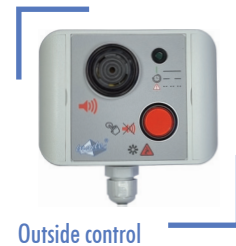
Outside control monitor