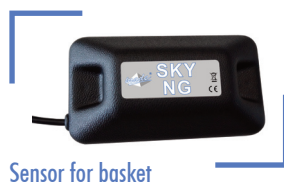
Sensor for basket